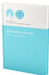
Children and the war in Ukraine 24.06- 24.07.2022