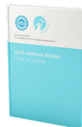
Children and the war in Ukraine 24.04.-24.05.2022