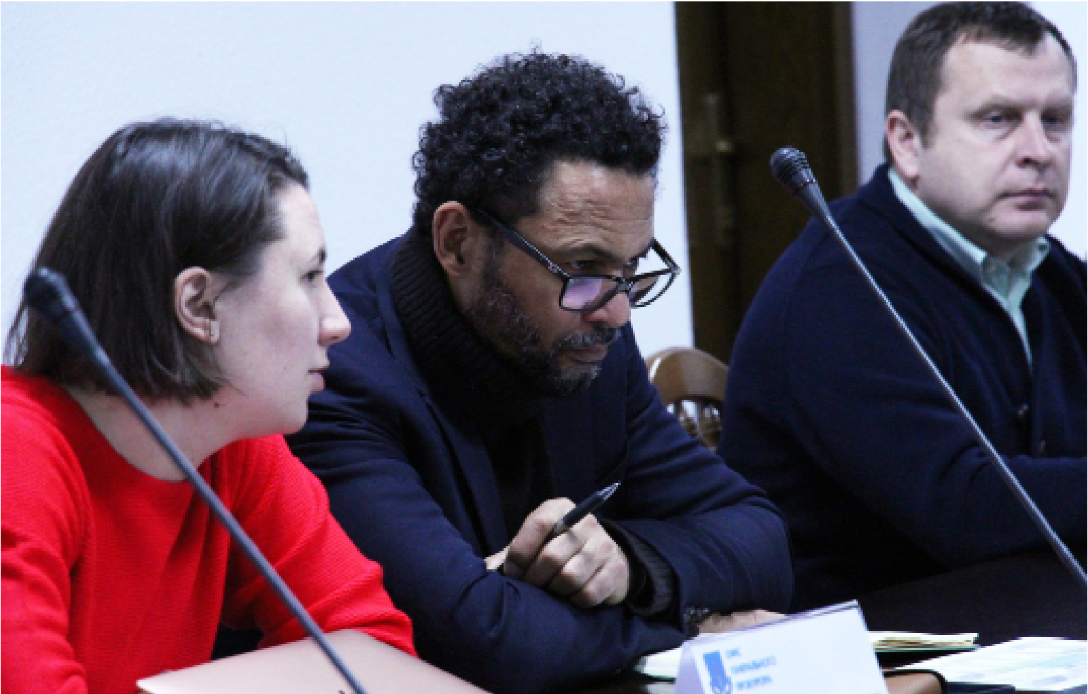
Picture: Meeting of the Council of International Experts at the Office of the Prosecutor General of Ukraine

During the year, the members of the KhISR also repeatedly advocated the protection of children's rights and the prosecution of Russian criminals on international platforms and in reports.