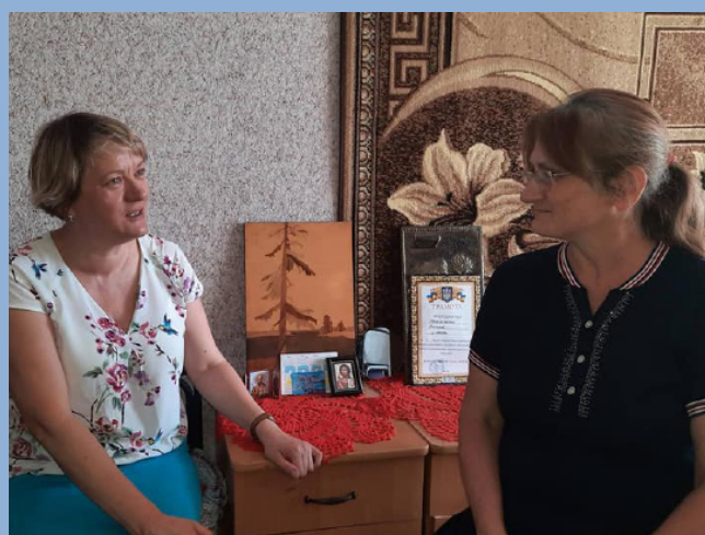
Picture: monitoring visit to Smilyanskiy PNBH

In the autumn of 2022, thanks to the support of the European Disability Forum, the KHISR Team started monitoring the protection of the rights of people with disabilities in psychoneurological boarding houses in Ukraine. 20 institutions were visited and more than 80 interviews were conducted with staff, residents of boarding houses and experts in the field of protection of the rights of people with disabilities. Next year, it is planned to write a report and make effective recommendations for the authorities regarding the improvement of living conditions in adult inpatient facilities during the war.