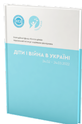
Children and the war in Ukraine 24.02-24.03.2022