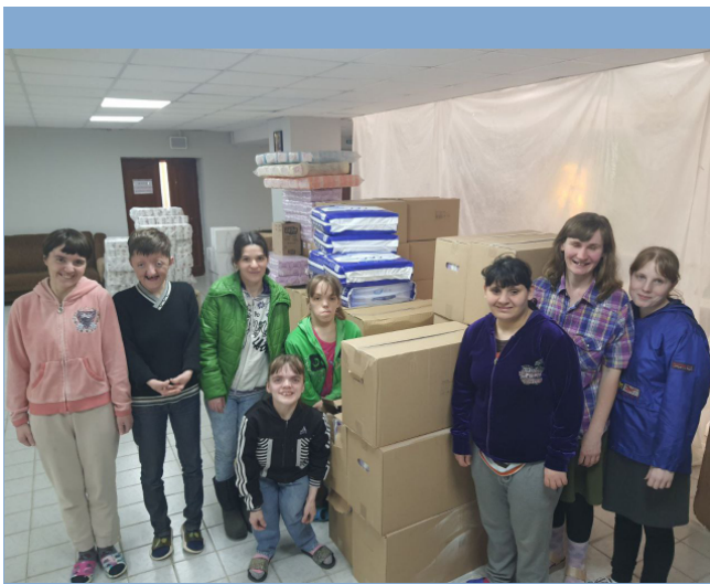
Picture: provided aid to boarding institutions in Kharkiv Region

of the most unprotected, but at the same time often forgotten category of citizens - adults in boarding houses who were located in the territory of active hostilities. In the spring of 2022, these facilities found themselves on the brink of survival due to the fact that traditional supply chains were severed and the reserves of such boarding house were extremely limited.