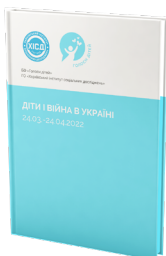
Children and the war in Ukraine 24.03.-24.04.2022