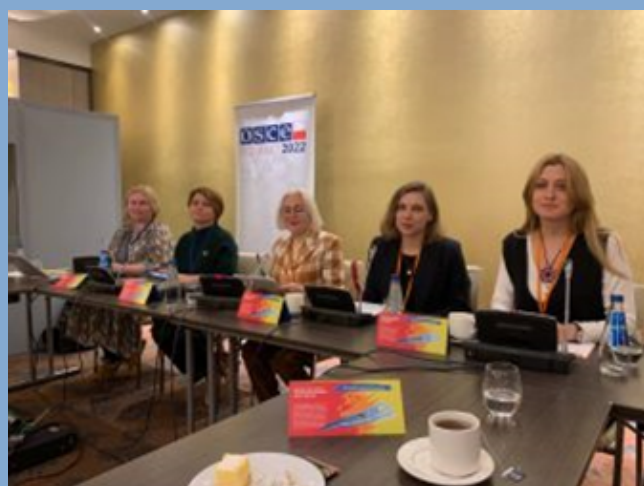
Picture: side event on the protection of the rights of Ukrainian children in the situation of mass migration at the Conference on the Human Dimension of the ODIHR OSCE in the fall in Warsaw (Poland) 1 .

organizations. The study made it possible to assess their situation after displacement and to understand how much humanitarian, social and psychological support for parents with children, foster families and family-type children's homes needs to be increased, what their key problems