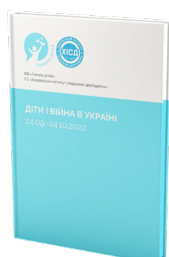
Children and the war in Ukraine 24.09- 24.10.2022