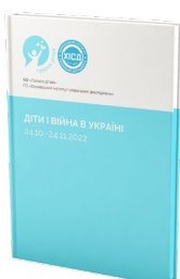
Children and the war in Ukraine 24.10. – 24.11.2022