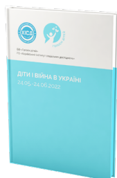
Children and the war in Ukraine 24.05-24.06.2022