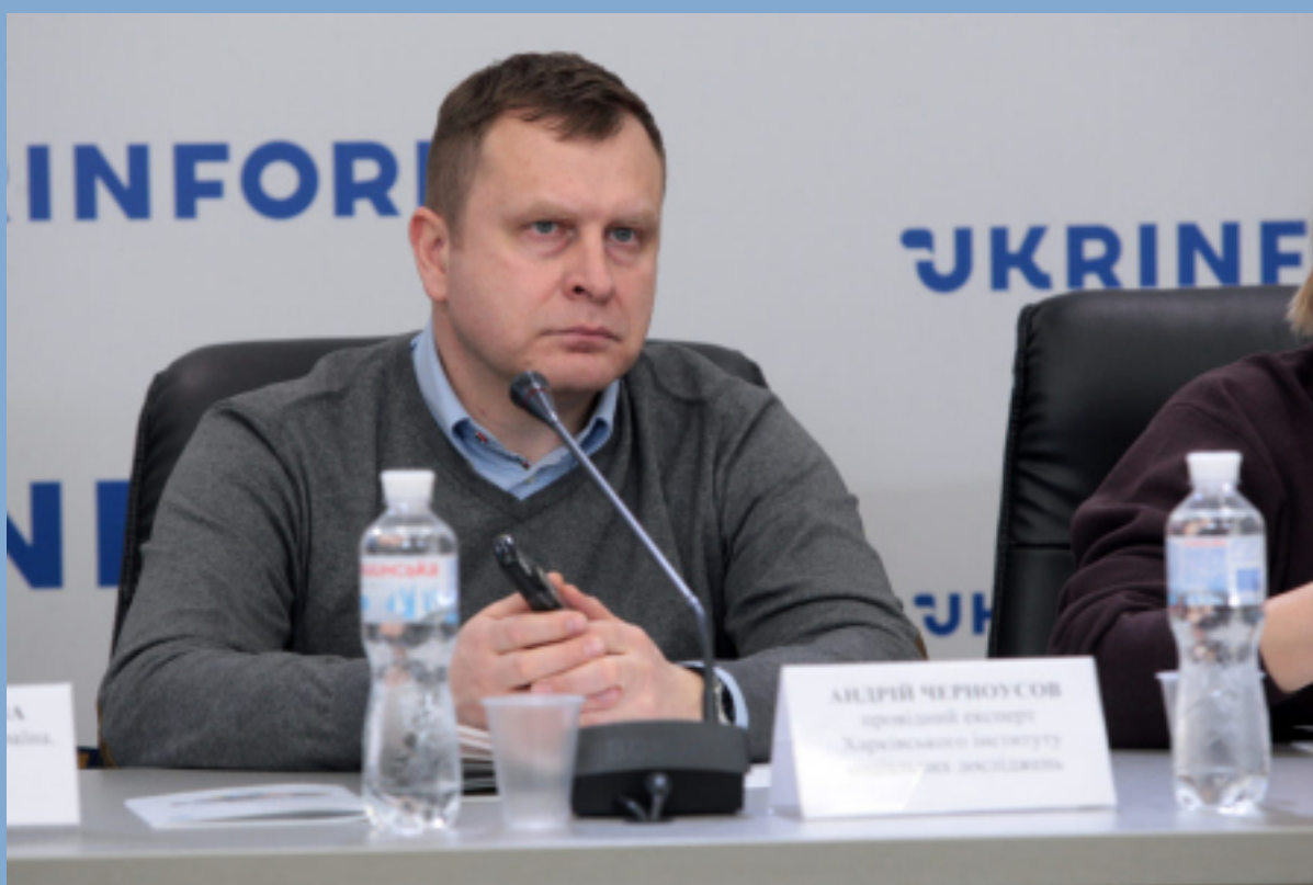
Picture: presentation of the research at the Ukrinform Agency

transitional justice. More than 3,000 respondents were interviewed through a quantitative survey. We analyzed what Ukraine's victory should look like and whether Ukrainians believe in the return of all occupied territories to state control; how Ukrainians treat citizens who cooperated with the occupation authorities, what post-war justice should be like; whether, according to the interviewees, post-war conflicts between different categories of Ukrainians are possible; what will be the main challenge for the citizens after the victory and what consequences of the war will have to be dealt with.