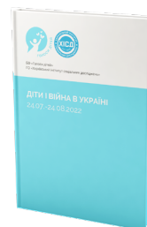
Children and the war in Ukraine 24.07.-24.08.2022