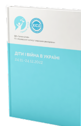
Children and the war in Ukraine 24.11- 24.12.2022