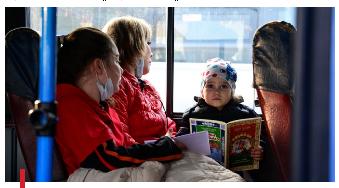
Deportation of residents of Mariupol to Russia<sup>58</sup>

ical care"<sup>57</sup>. Also, the reason for the taking away children is "rehabilitation in children's camps", "patriotic education", "visiting the Christmas tree and invitations to holidays in Russian cities". Deportation of children brought up in the boarding institutions is also documented.