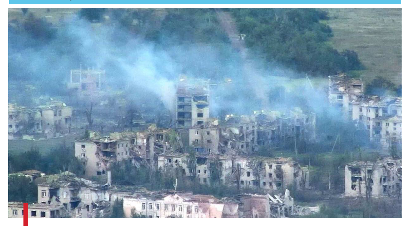
The village of Pisky, the Donetsk region, was almost completely destroyed after the occupiers struck, on August 116

On September 3, the occupiers bombarded the village of Bezruky, the Kharkiv region, with phosphorus bombs. 16 houses were destroyed<sup>7</sup>.