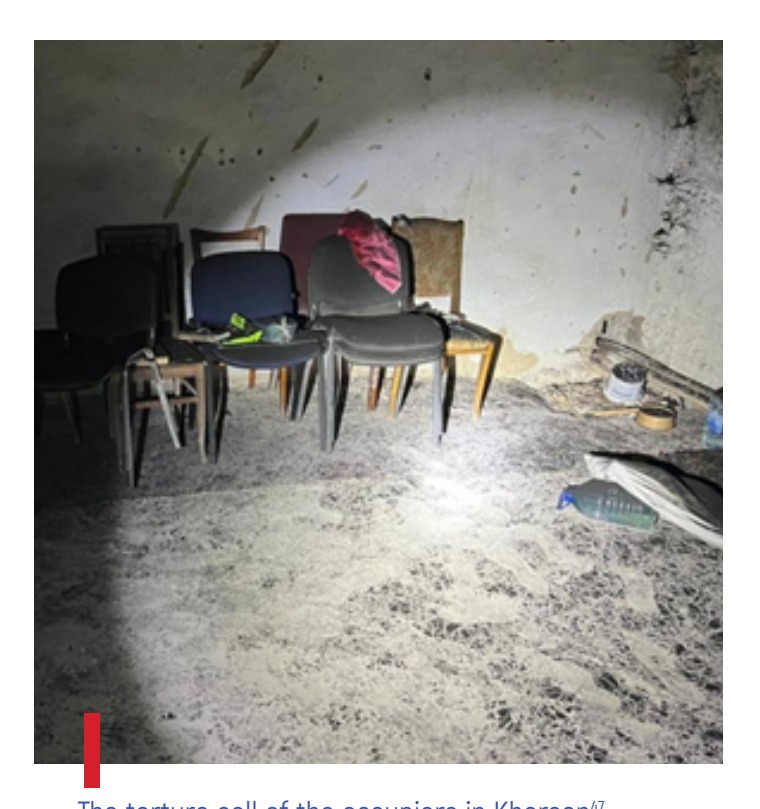
The torture cell of the occupiers in Kherson<sup>47</sup>.

On November 18, in the village of Komysh-Zorya, the Zaporizhzhia region, Russian servicemen shot dead a family together with two children aged 5 and 14 in their own residential house<sup>44</sup>.