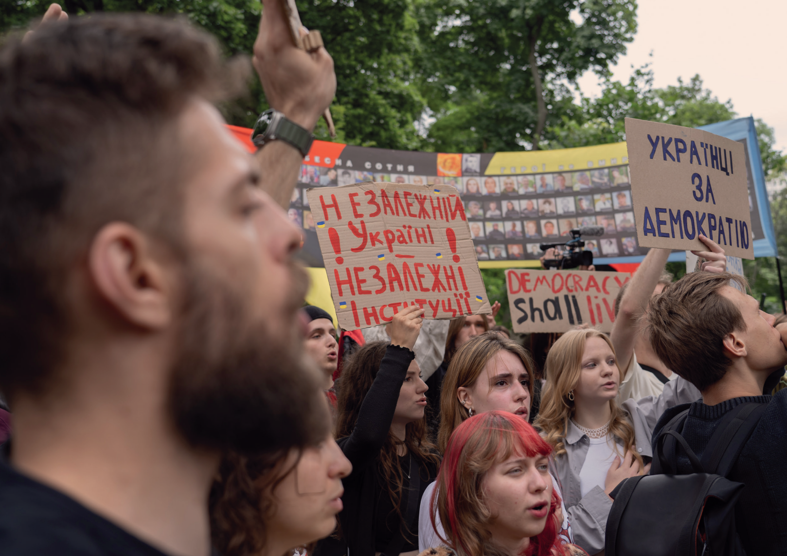
Anti-corruption protests in Ukraine, Kyiv, July 23, 2025. Inscriptions on the banners: “Independent Ukraine – independent institutions” and “Ukraine – for democracy.”