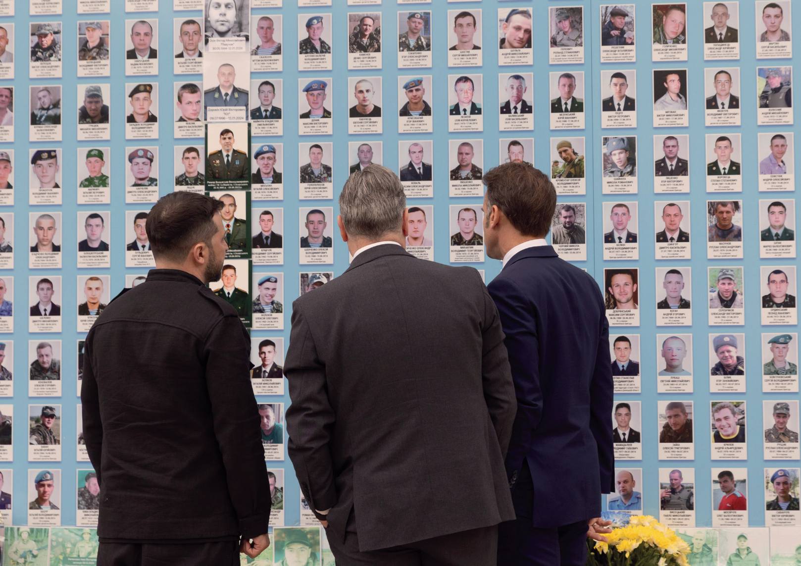
President of Ukraine Volodymyr Zelenskyy, President of France Emmanuel Macron, and Prime Minister of the United Kingdom Keir Starmer visit the Wall of Remembrance at St. Michael's Square, lay flowers and honor fallen Ukrainian soldiers in Kyiv, May 10, 2025.